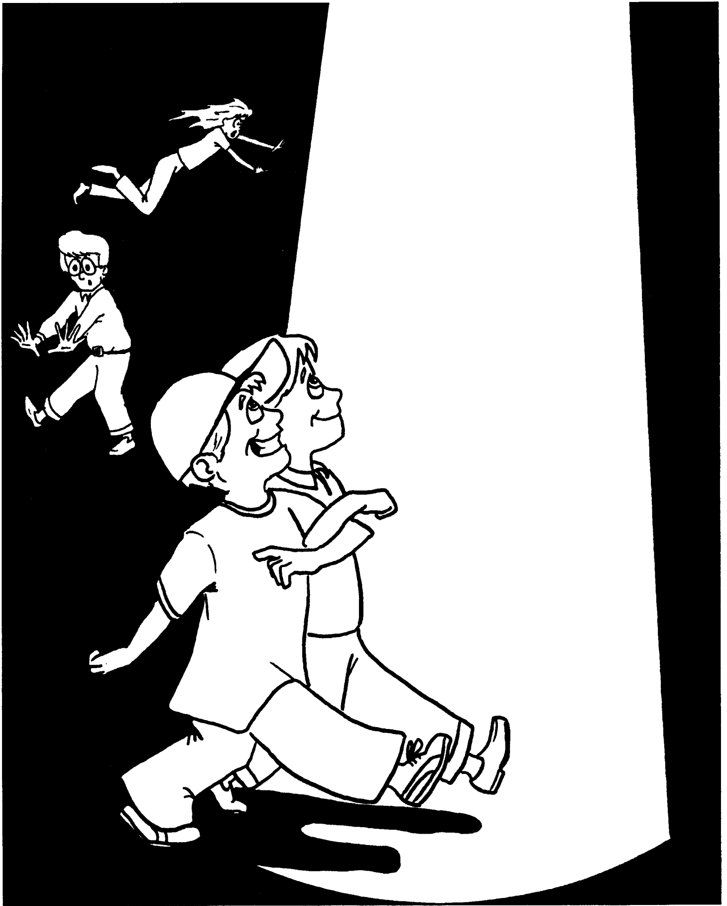
"Walking in the Light" 1John 1:5-10