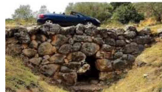
3,300-year-old chariot bridge that is still in use today. The Arkadiko Bridge in Greece was built between 1300 and 1190 BCE, making it one of the oldest still-used arch bridges still in existence. Built on a road that linked Tiryns to Epidaurus, it was part of a larger military road system.